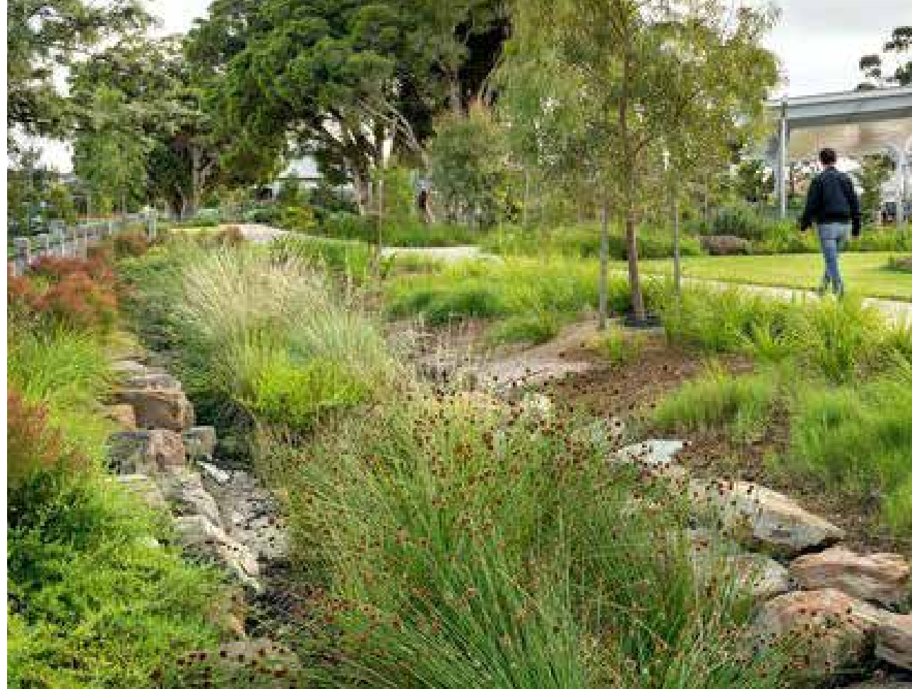
Native planted drainage swale