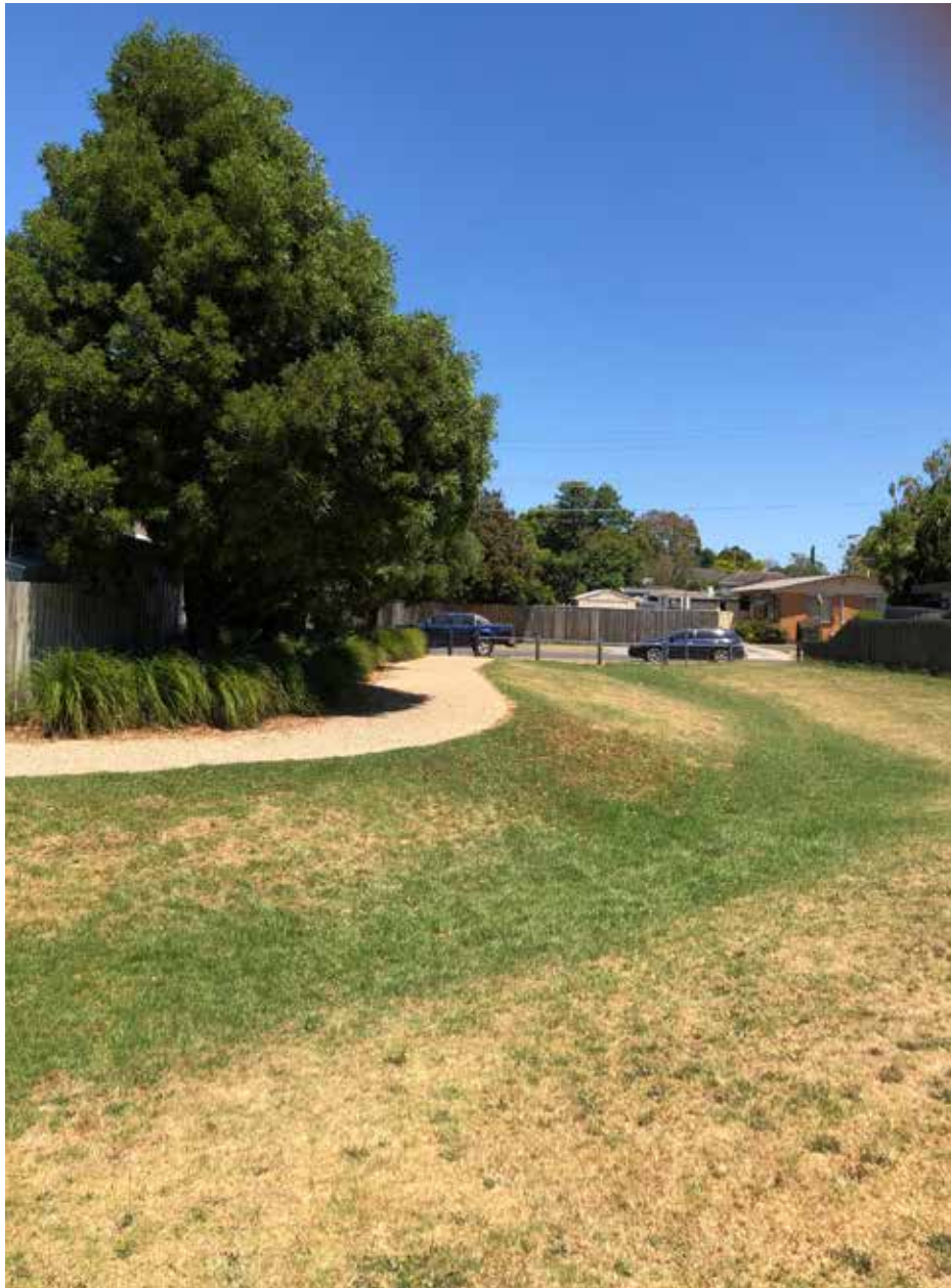
Jacana Ave link with row of native Blackwood trees and pathway to be retained, grass drainage swale may be planted with native ground-covers