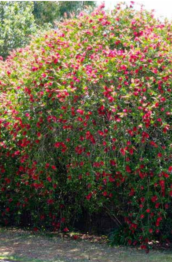
Native evergreen small tree Weeping Bottlebrush (Callistemon Viminalis)