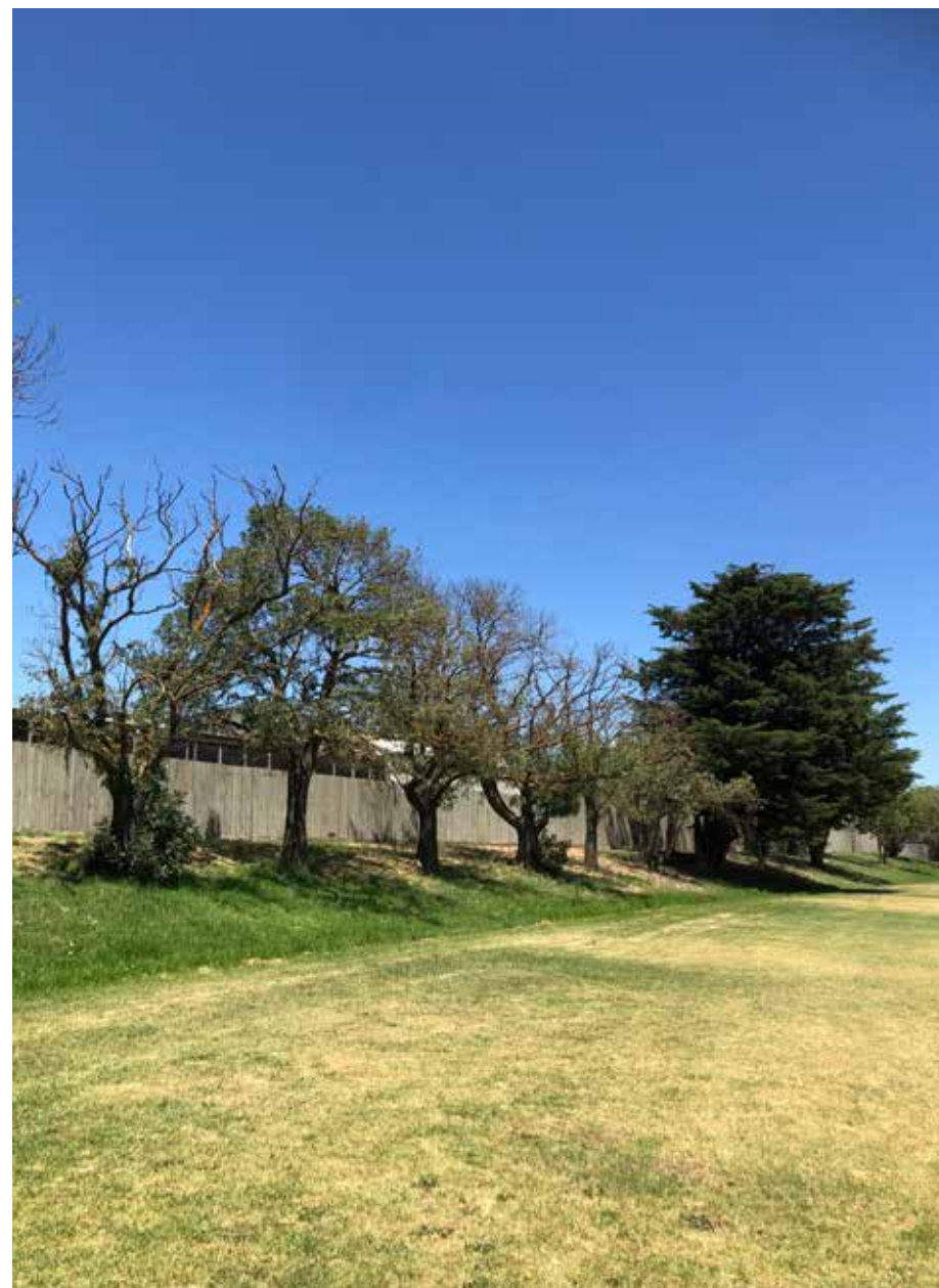
Row of exotic trees considered for removal, including Golden Ash & Cypresses