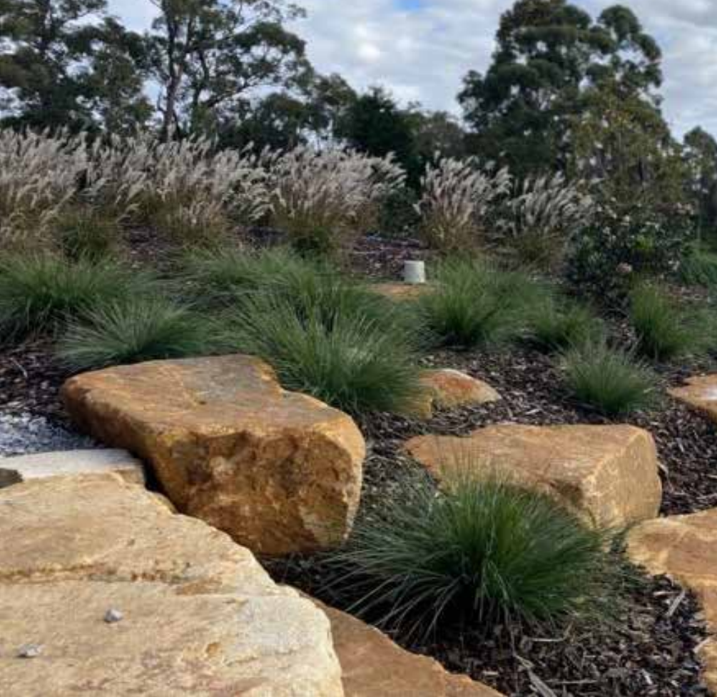
Natural rock boulders to garden bed escarpment