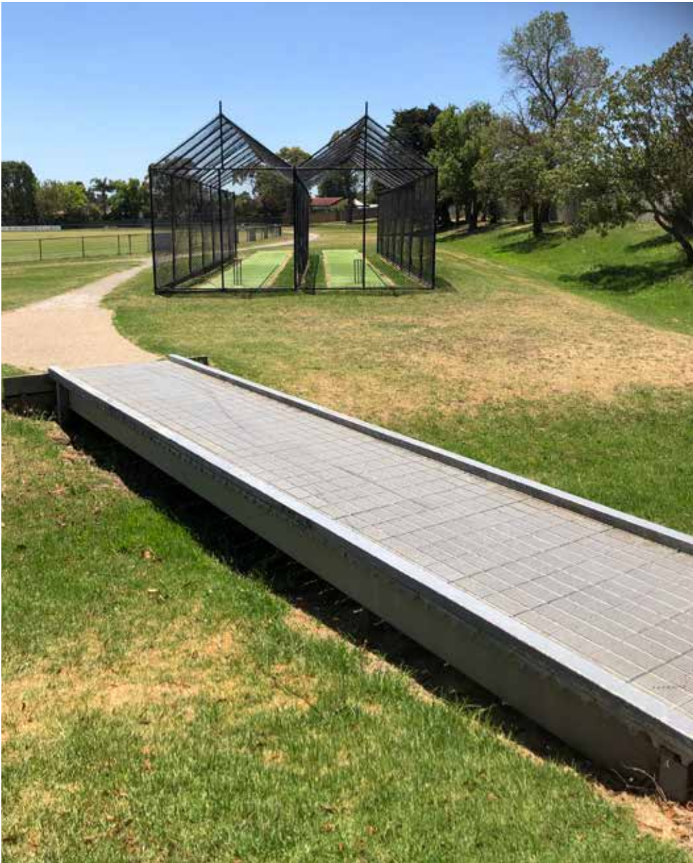
Low height bridge / boardwalk over grass swale to be retained with possible realignment with new pathway