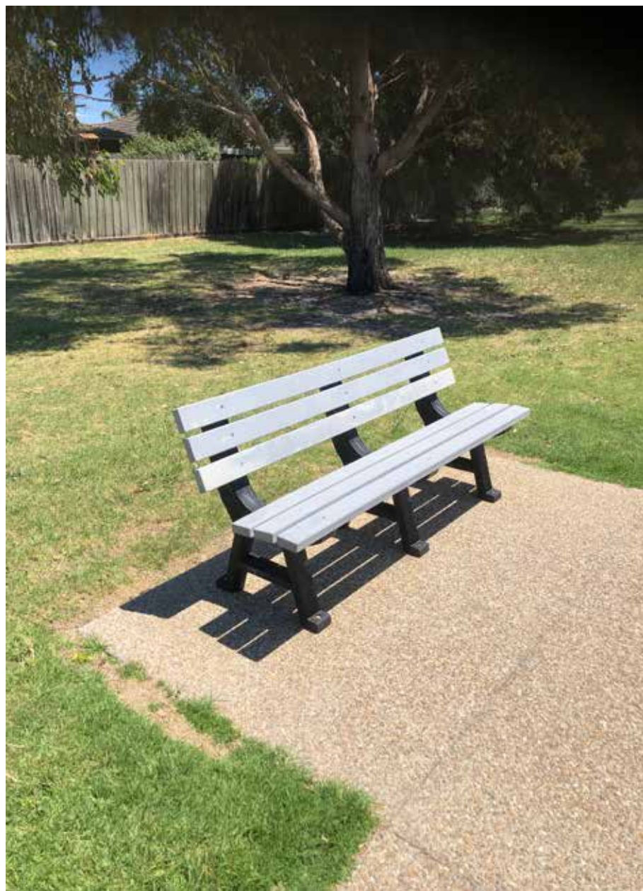
Existing park seats to be replaced