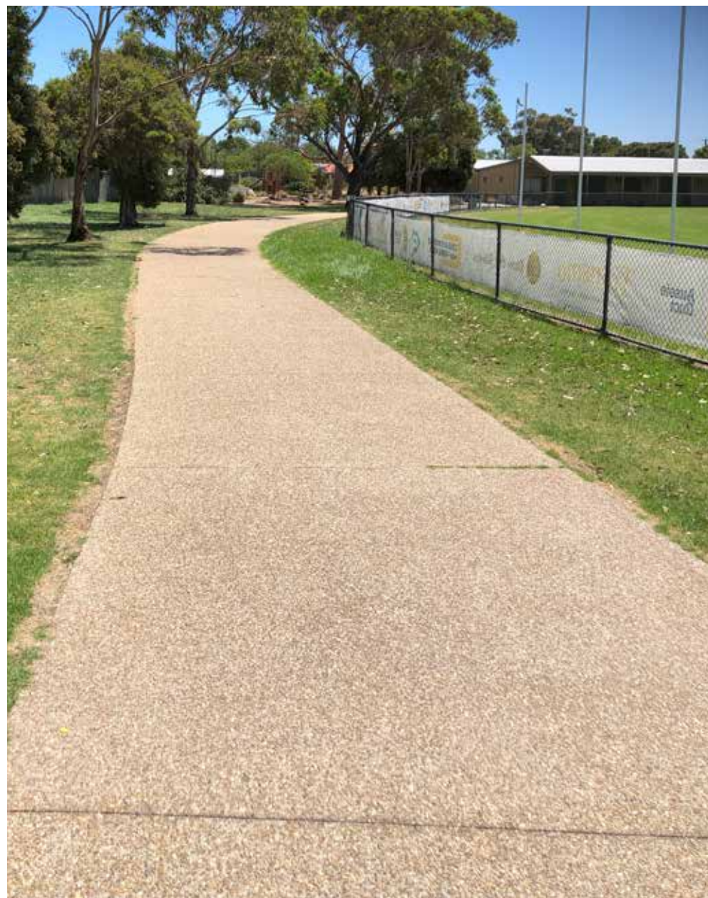
Sealed pathway to be retained. Fencing (shown right) to be replaced to oval perimeter