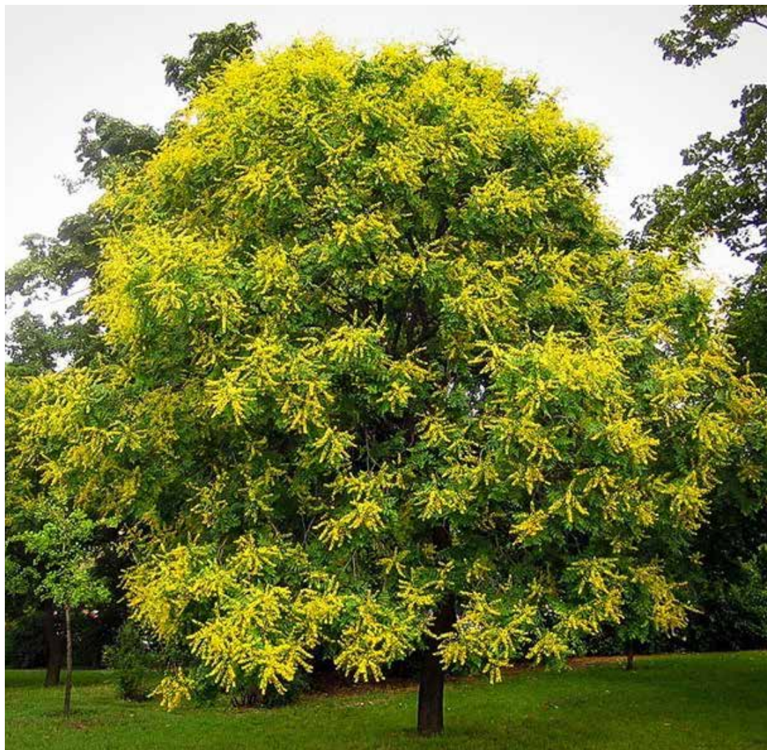
Deciduous canopy tree Golden Rain Tree ( Koelreuteria paniculatum)