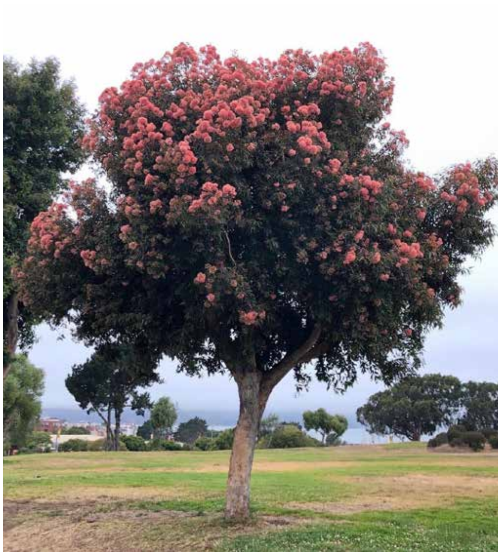
Native evergreen canopy tree Red flowering Gum (Corymbia ficifolia)