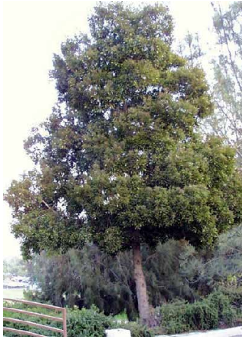
Native evergreen canopy tree Blackwood (Acacia melanoxylon)