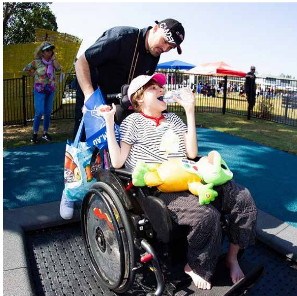
Additional equipment & opportunities for accessible play to existing play-space