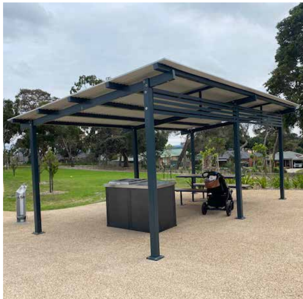
Proprietary shelter, drinking fountain, BBQ & picnic setting