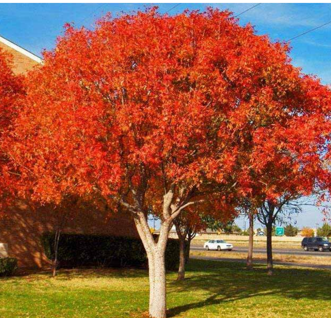
Deciduous canopy tree Chinese Pistachio (Pistacia chinensis)