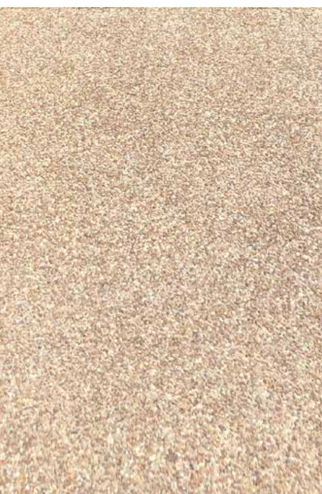
Coloured/exposed aggregate concrete for new pathway