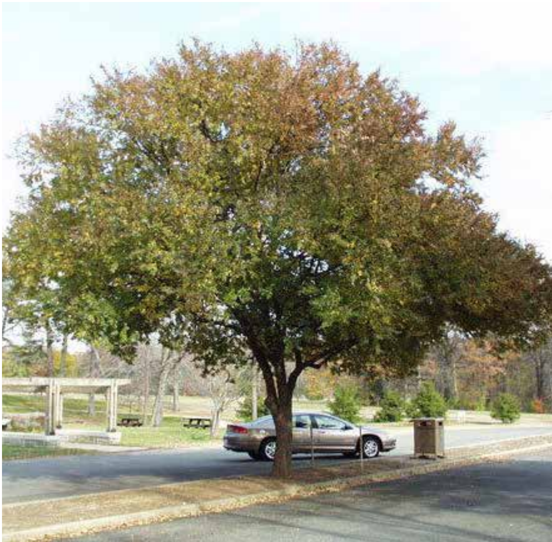
Deciduous canopy tree Chinese Elm (Ulmus parvifolia)