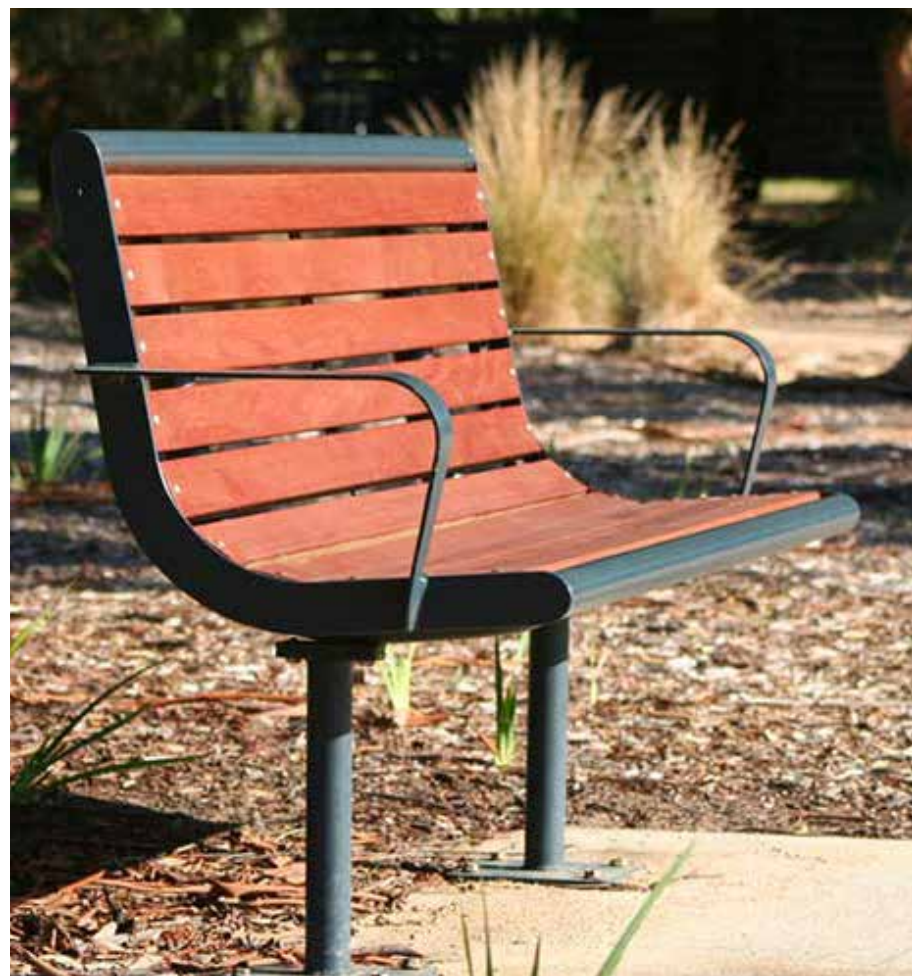
Proprietary seating with backrest & armrests