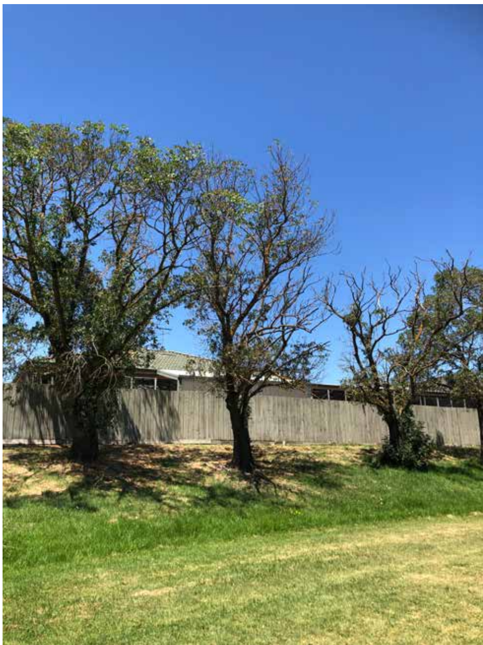
Row of exotic Golden Ash trees planted on eastern embankment are showing signs of declining health, grass swale at base