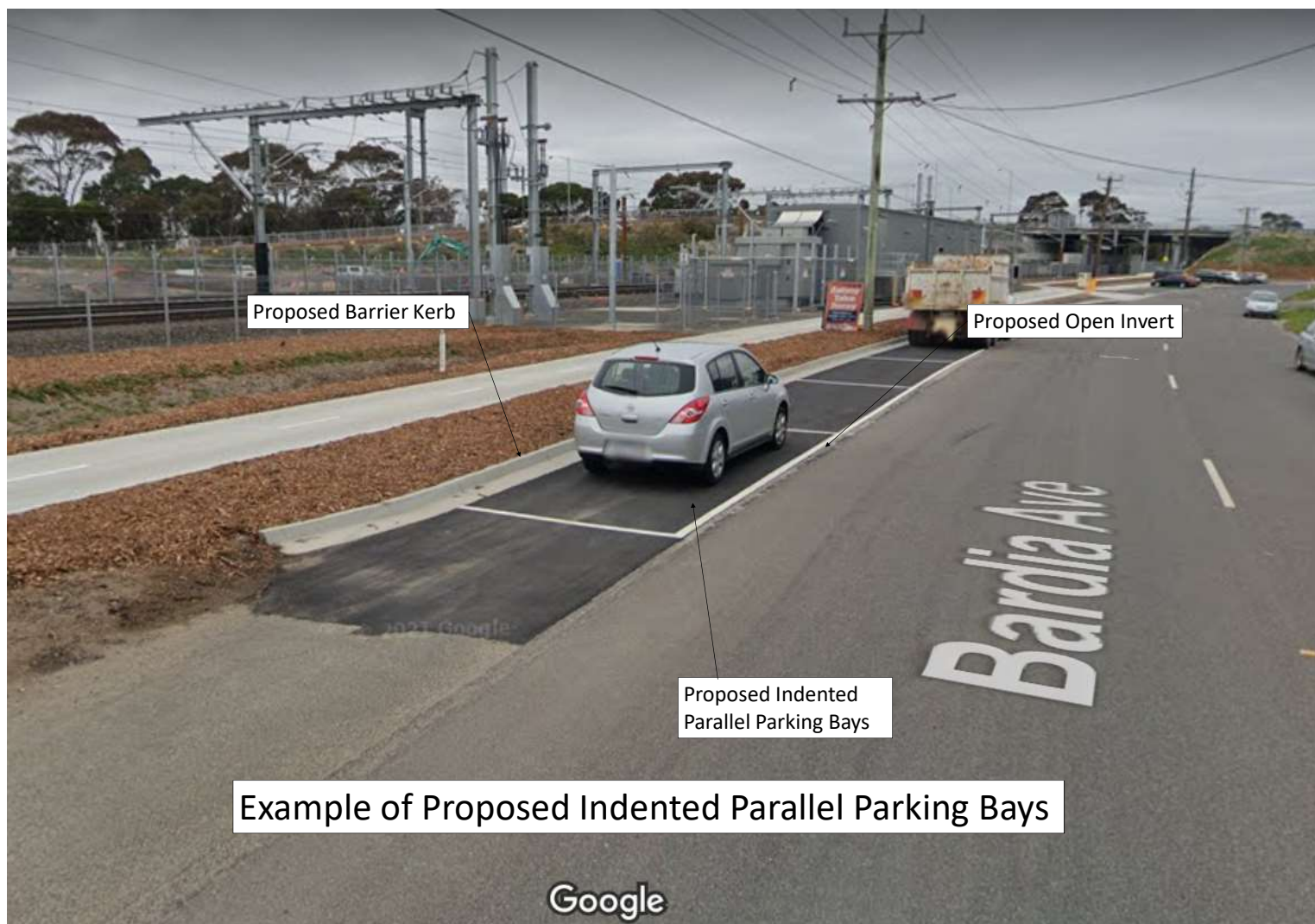
Example of Proposed Indented Parallel Parking Bays