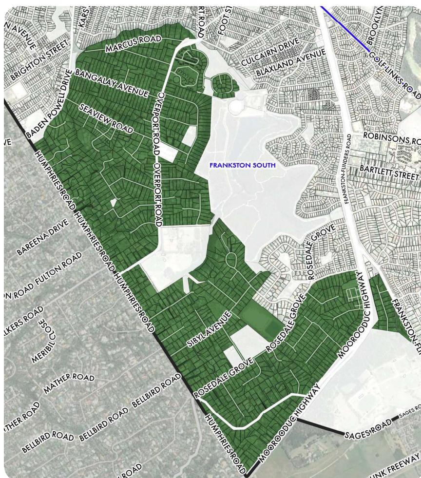
Figure 29. Bush Coastal 2 Area Map