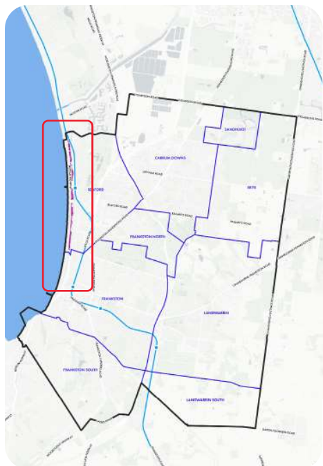
Figure 53. Foreshore 3 Key Map