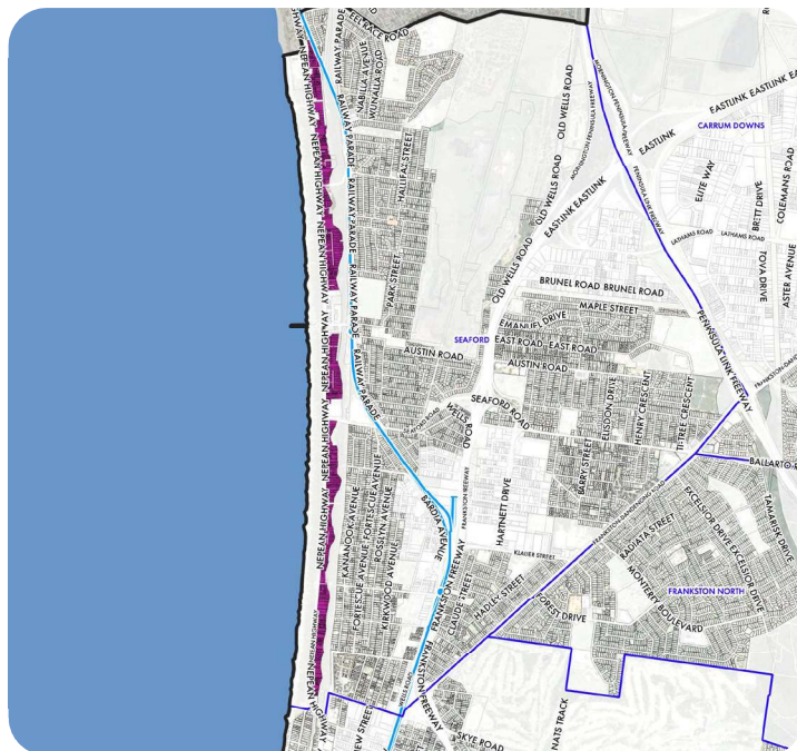
Figure 52. Foreshore 3 Area Map