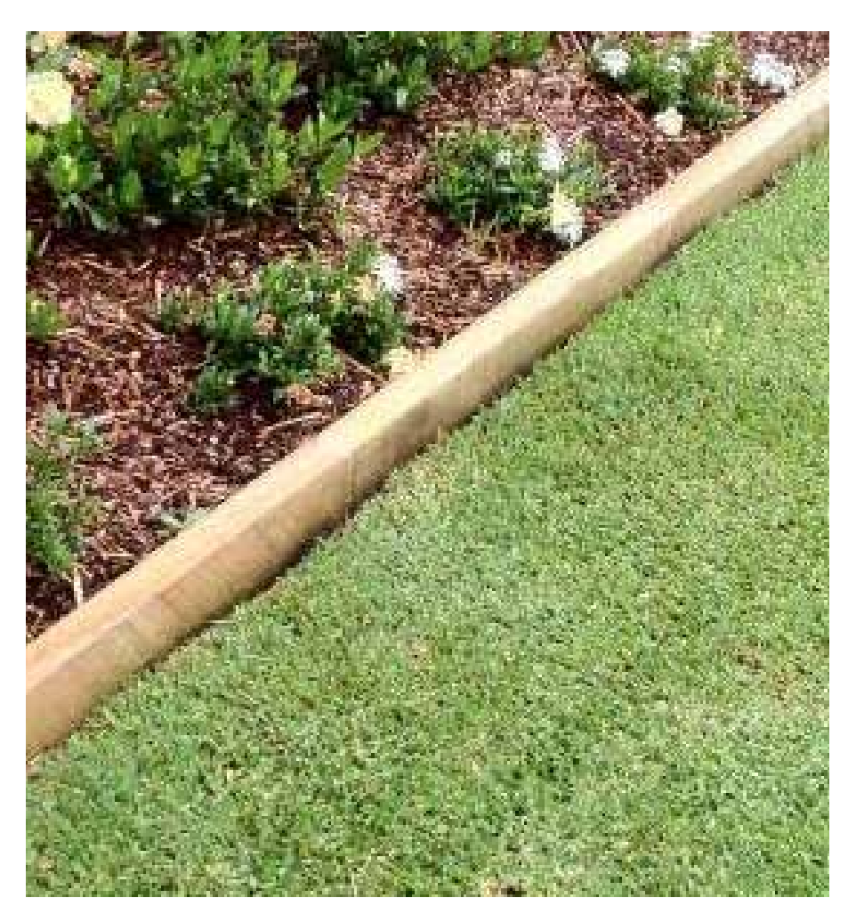
Timber edging to garden & lawn interfaces