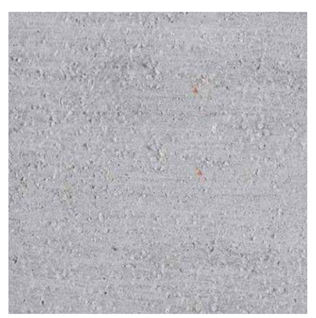
Grey coloured concrete for new paved areas