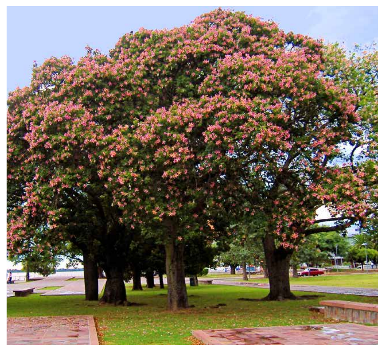
Exotic deciduous canopy tree Ceiba Speciosa