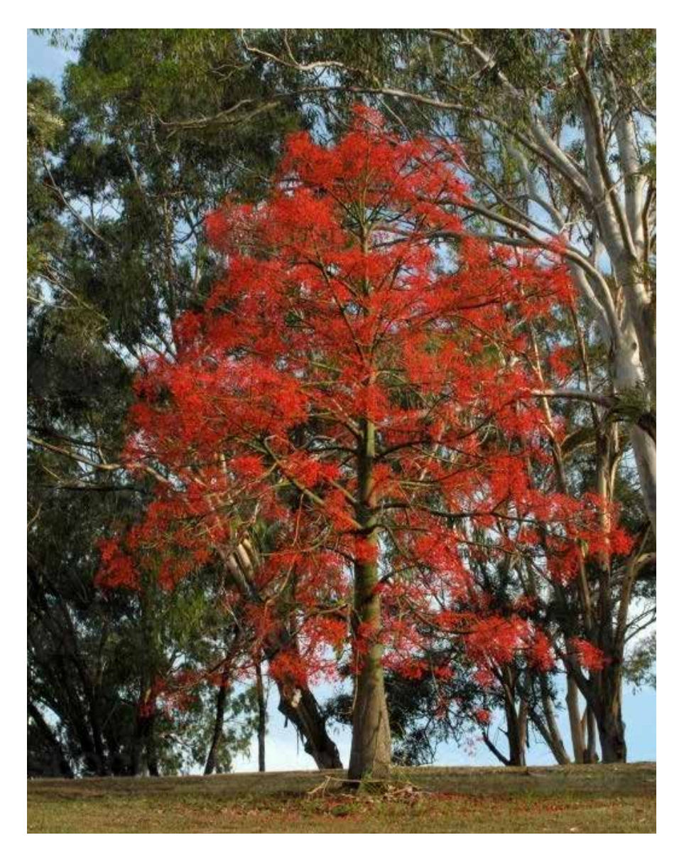
Native semi-deciduous canopy tree Brachychiton acerifolius