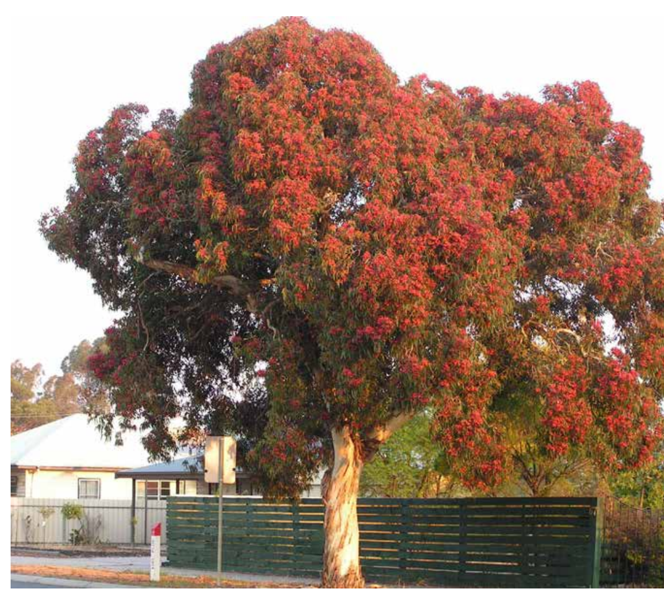
Native evergreen canopy tree Eucalyptus leucoxylon 'Rosea