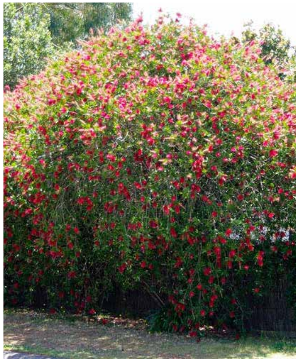
Native evergreen small tree Callistemon Viminalis