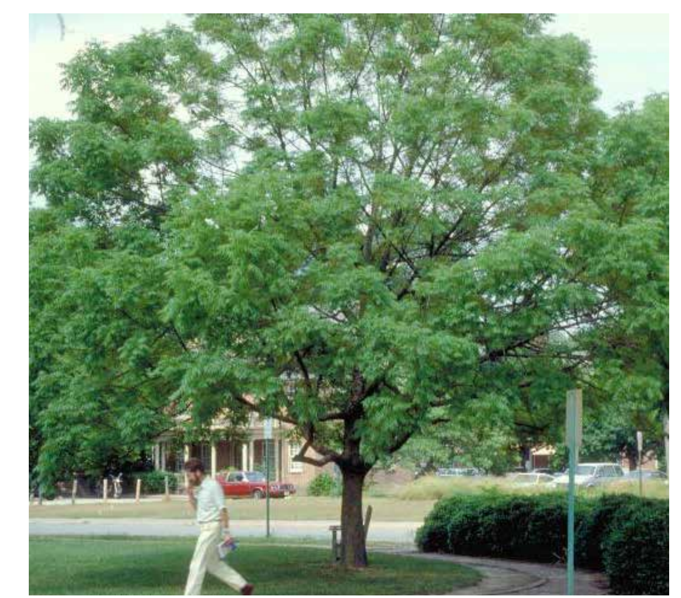
Exotic deciduous canopy tree Pistacia chinensis