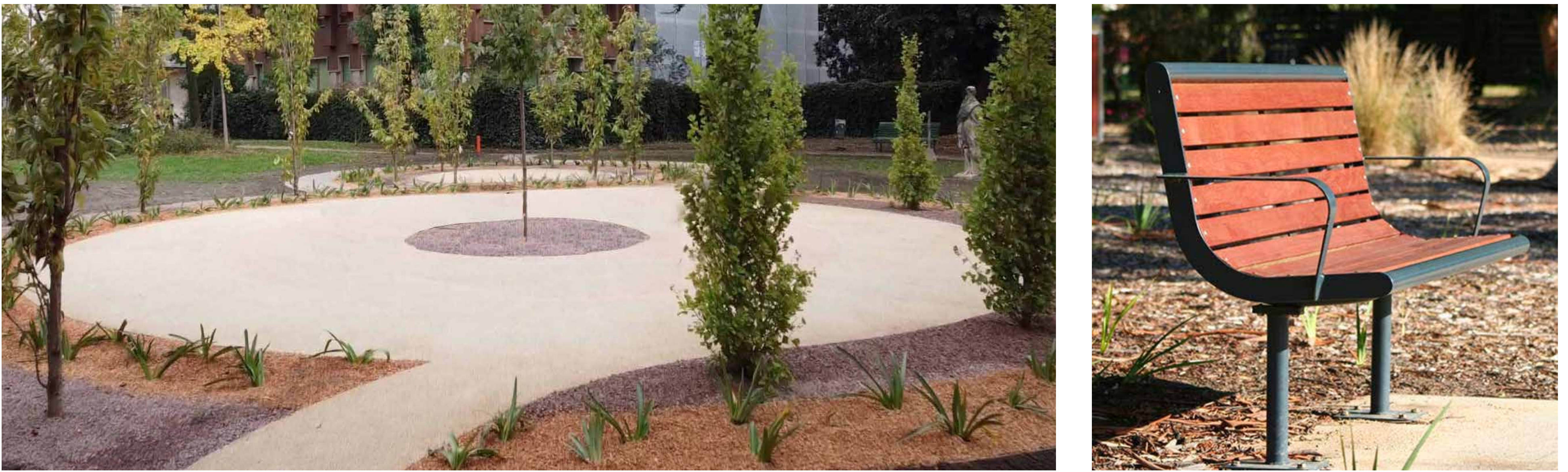
Circular concrete paved area with provision for seating, surrounding planting also configured with circular formation