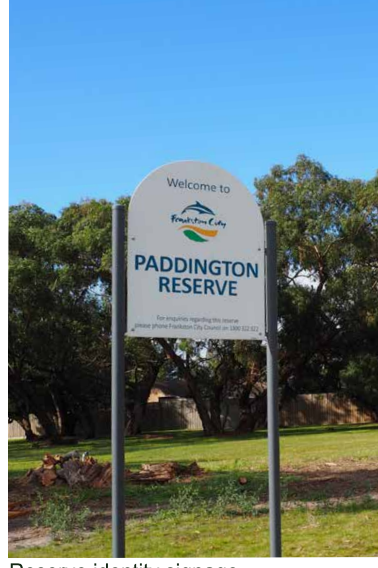
Reserve identity signage